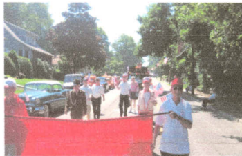
Our banner leading in front of our marchers.

Pre-Game activities: the famous Henjhl Polish dancers entertaining the crowd as seen on one of the giant screens at Citi field.