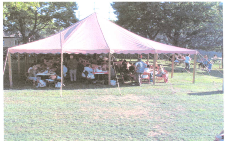
Like magic IT IS UP! Members and quest are enjoying the shade while feasting on lobsters, clams and BBQ chicken.

Notice: At the January meeting new officers and directors will be voted in. Also The annual regular and associate dues are due.