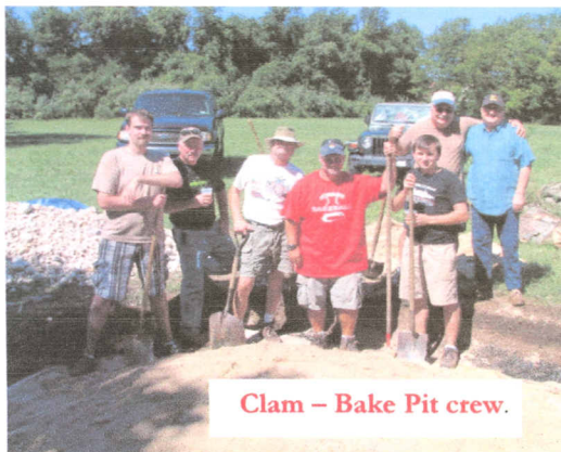
Clam - Bake Pit crew.